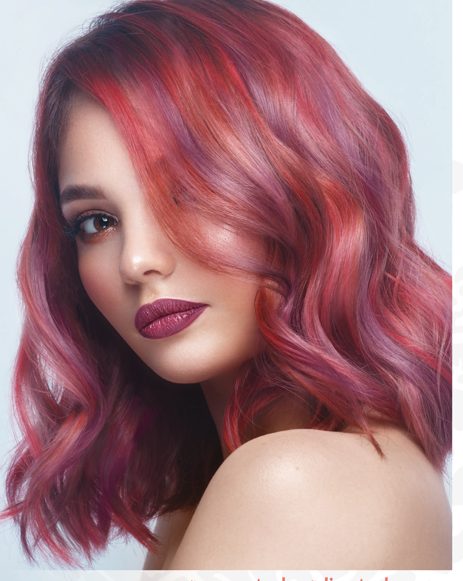
#conceptcolor #directcolor #vivid